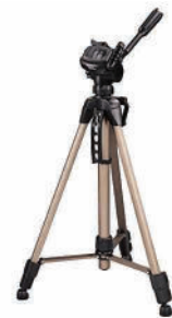
Tripod photo stand for TroublePad station