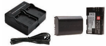
Battery kit for TroublePad lighting block