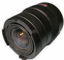
Wide angle varifocal lens 4,0 - 12,0mm