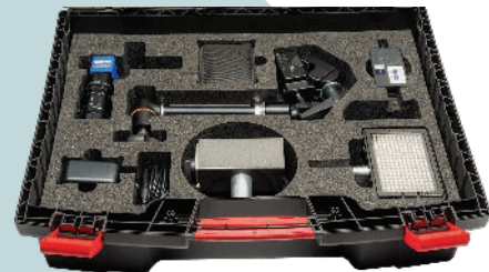
TroublePad workstation in its carrying case