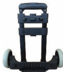
Removable trolley for TroublePad carrying case