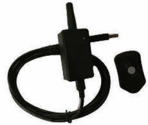
Radio trigger for TroublePad station