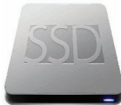
512GB and 1TB tablet option