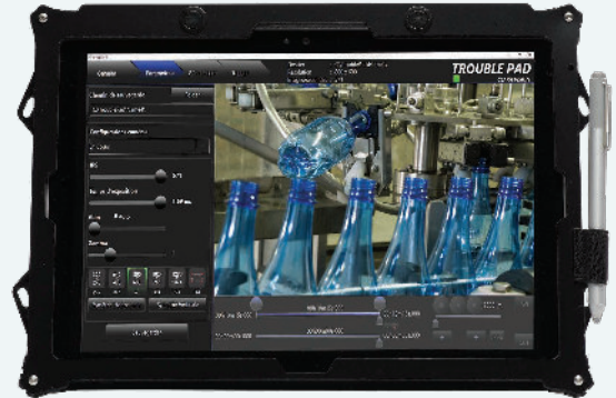
Simplified user interface for maximum ease of use