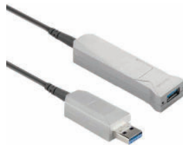
Long-length hybrid cable (10, 20, 50 meters)