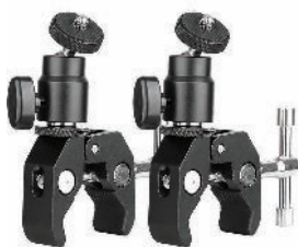
Quick fixing clamps