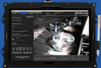
TroublePad high-speed camera on its bracket mount, and tablet-based software