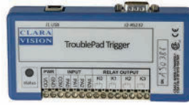
Trigger box +/- 24V and USB hub