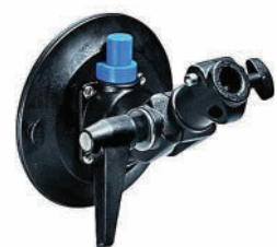
Suction cup for TroublePad station