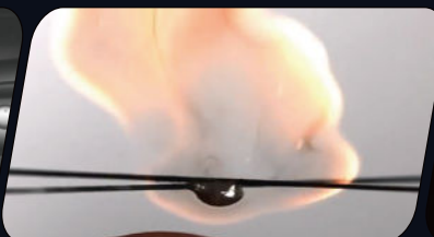
Research: Liquid combustion