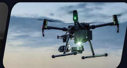
Military: Drone mounting