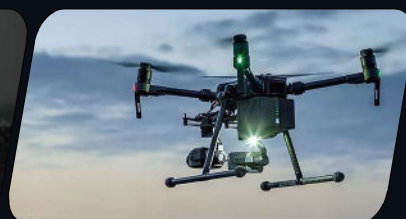
Military: Drone mounting