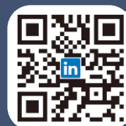
SinceVision's Linkedin Account