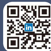
SinceVision's Linkedin Account